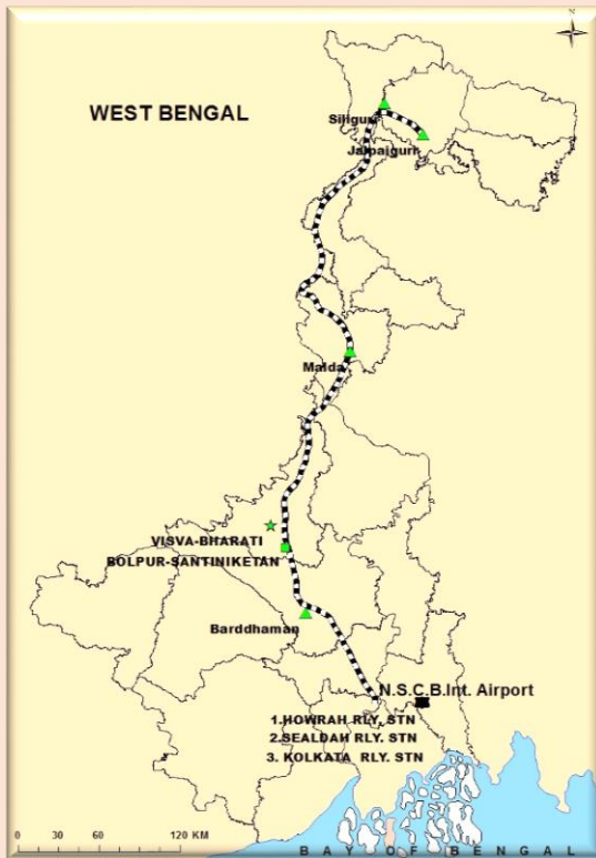
Time Table between Bolpur-Santiniketan and Howrah/ Sealdah/ Kolkata (via Bardhaman)