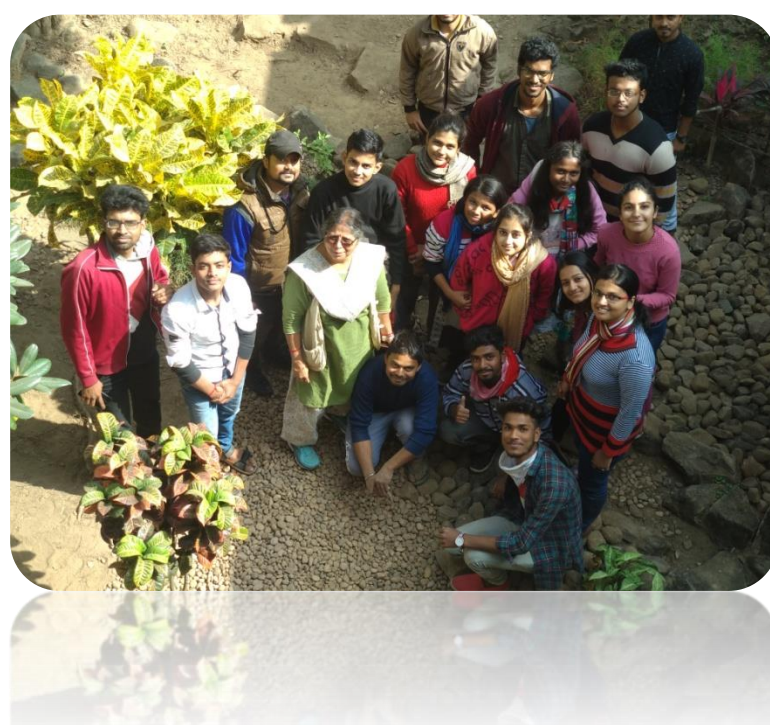
Edited by: Page Design: Prosenjit Chakrabortty, Doctoral Scholar Department of Japanese Subhajit Chatterjee, Doctoral Scholar Department of Japanese