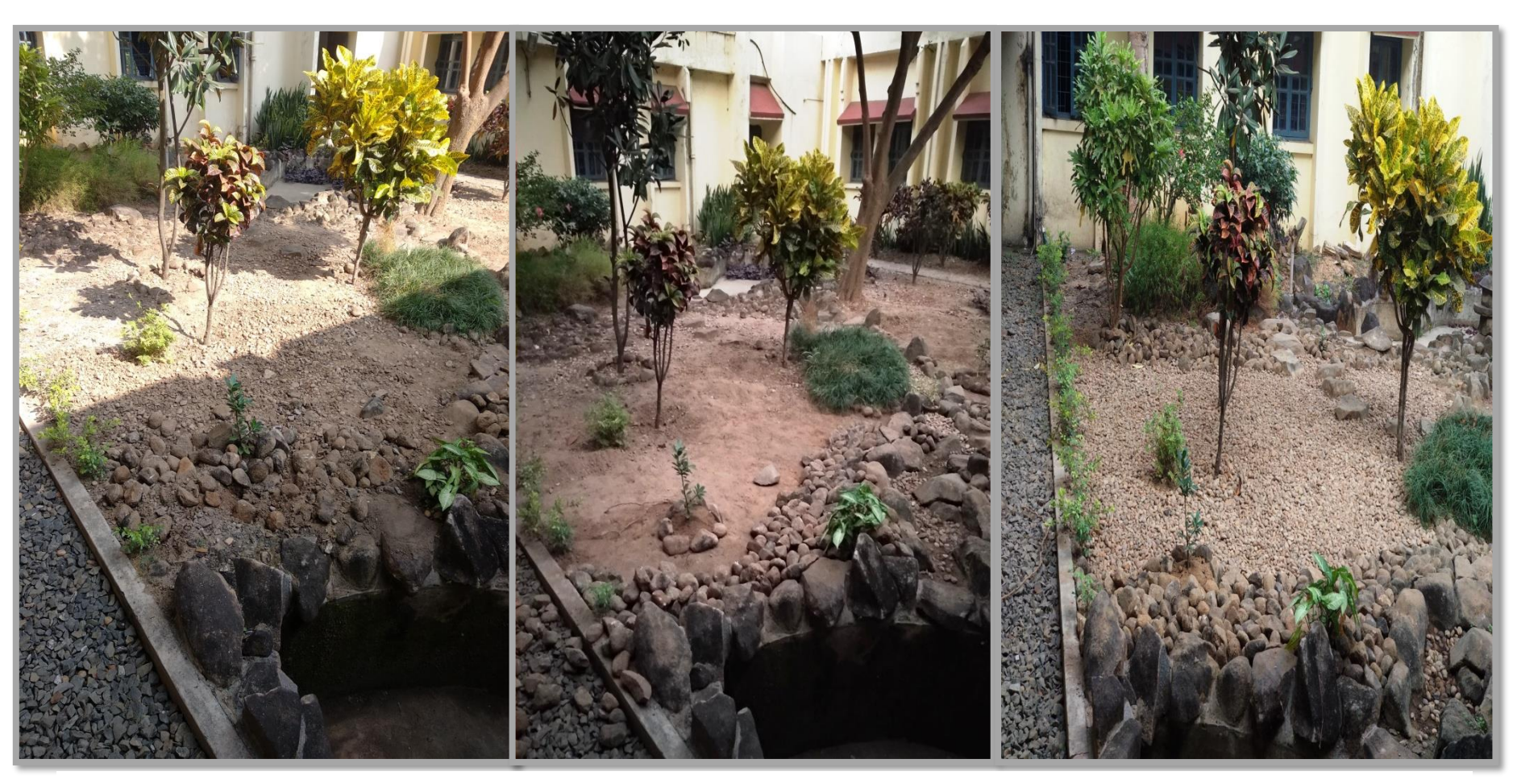
Japanese Rock Garden, Department of Japanese, Nippon Bhavana (Left to Right)