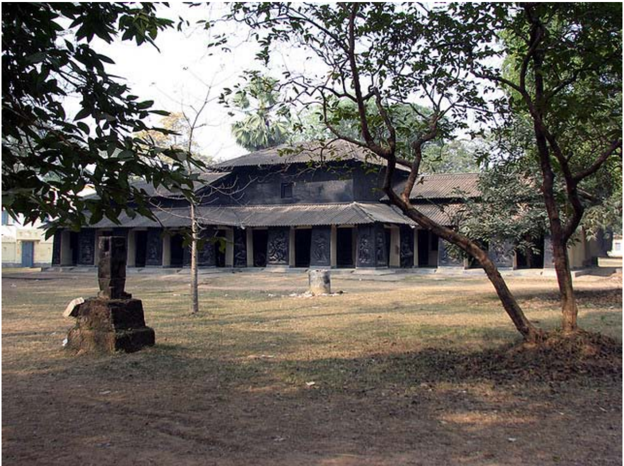
Prsésent day Image of Black House

Black house begun in the year 1936.Factors involved in its making.