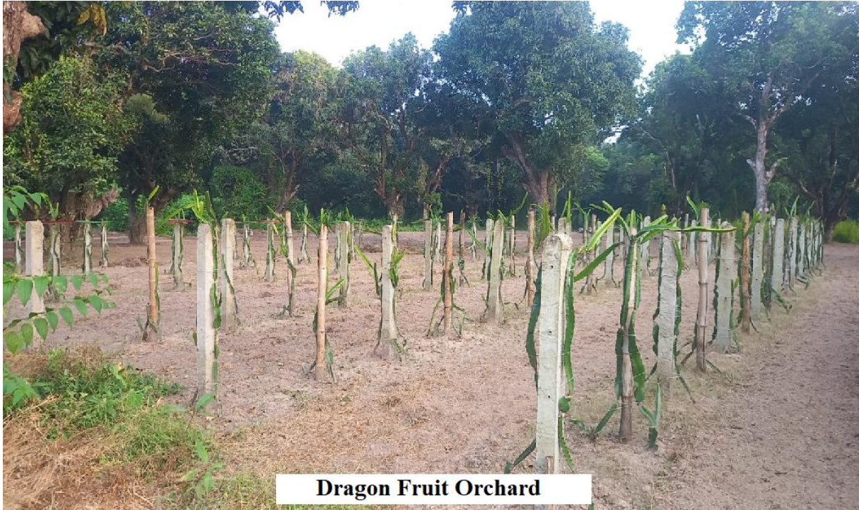
Dragon Fruit Orchard