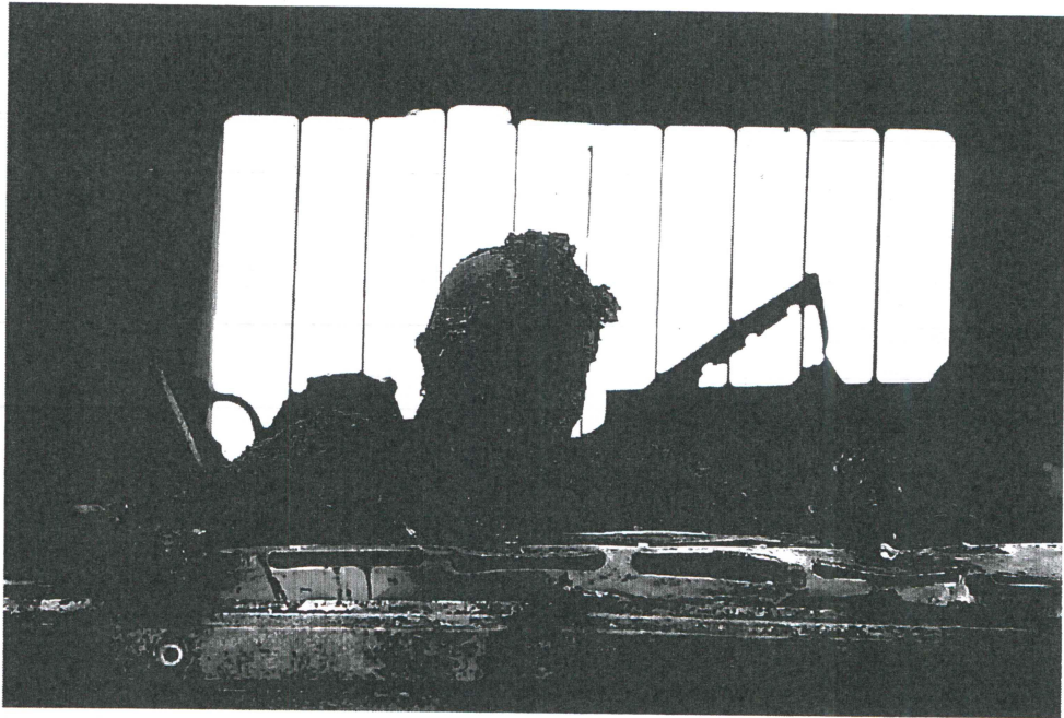
1991 Gulf war